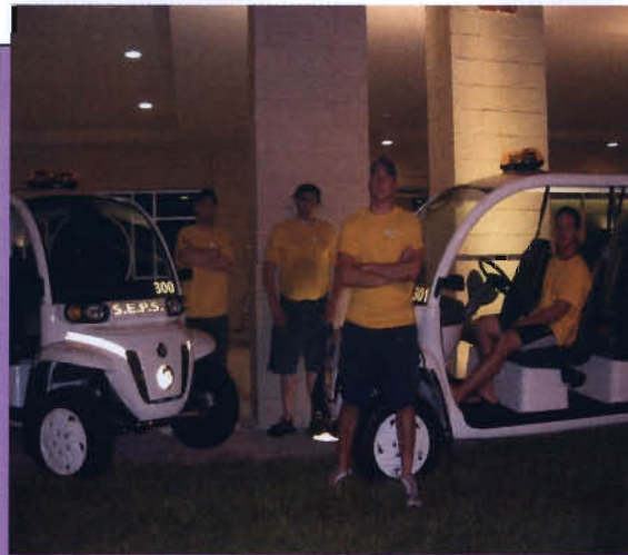
SEPS working on the main campus.

Women have the same rights as men in the United States. For example, women may express an opinion, buy whatever they wish, and drive where they like without being harassed. There are laws to protect all, equally.